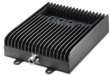
SureCall Fusion5s-CA Booster